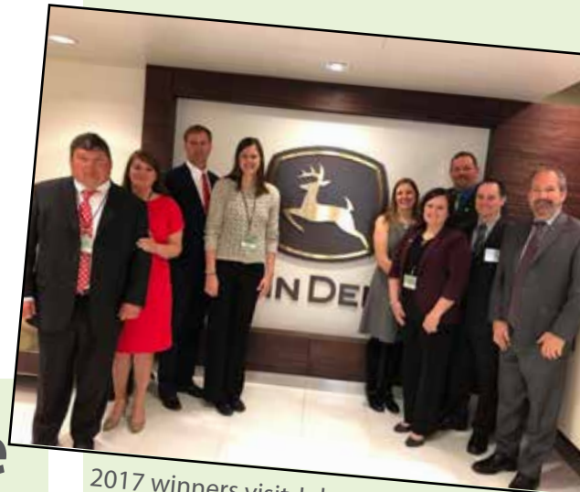
2017 winners visit John Deere