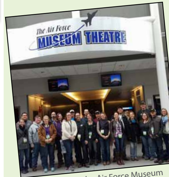
Class of 2016 at the Air Force Museum